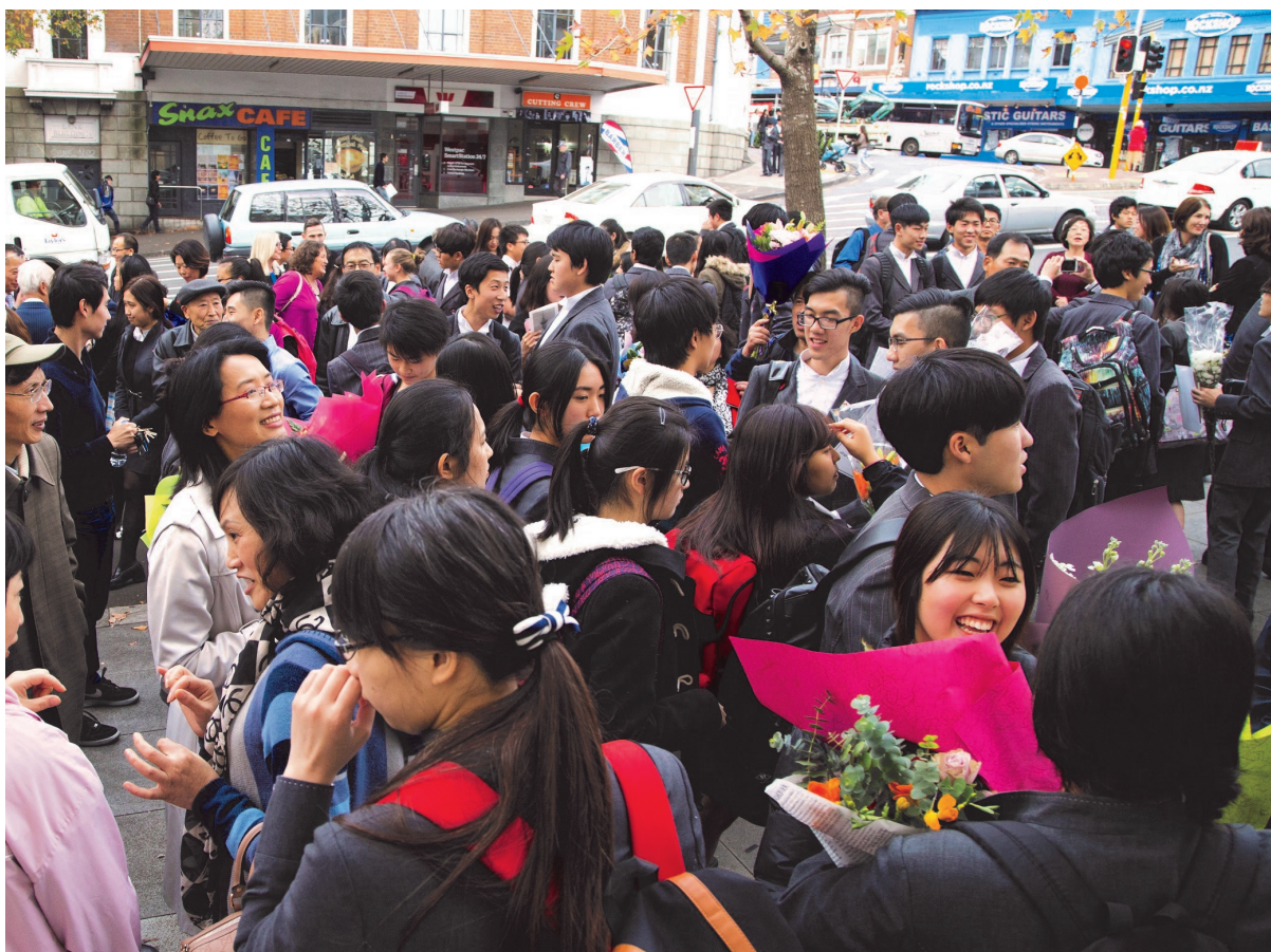
Parents, students and staff after AIC Graduation ceremony